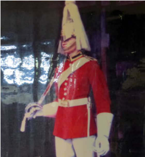
Cloth in Action