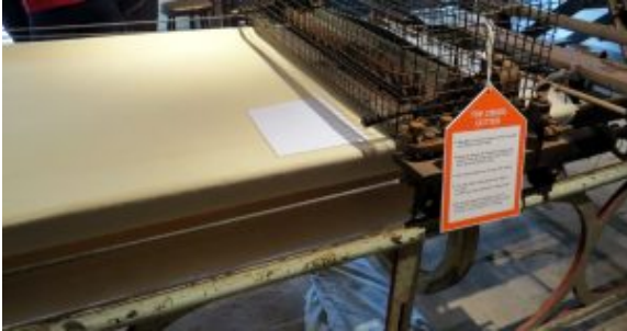
Shearing the Cloth