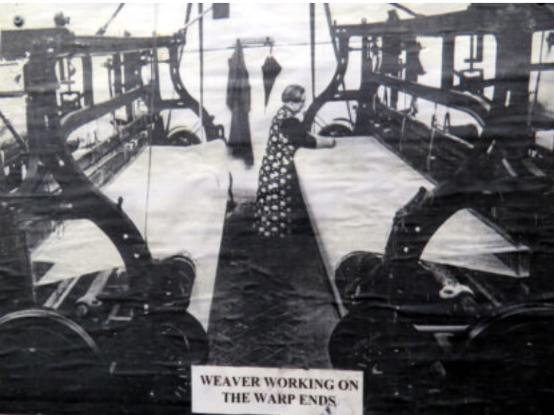
The old Machines