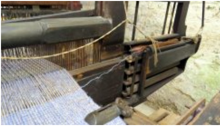
The Flying Shuttle