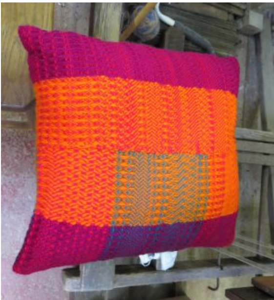
Woven fabric Pillow