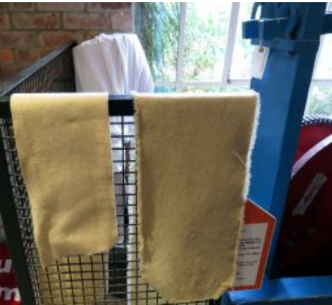
Pre and post finishing