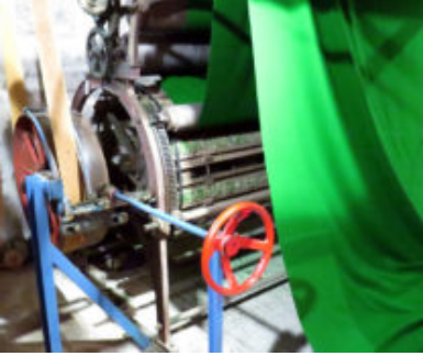
Raising the Cloth