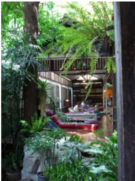
The oasis garden

http://www.phranakorn-nornlen.com/ even their site is cute ☺