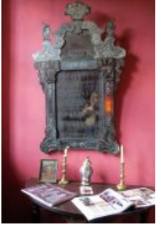
Bloody Marys Room