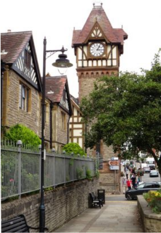
Ledbury Clock Tower