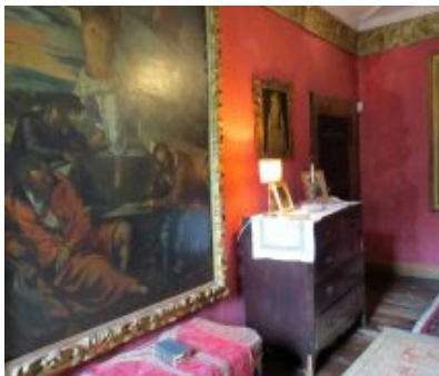
Bloody Marys room