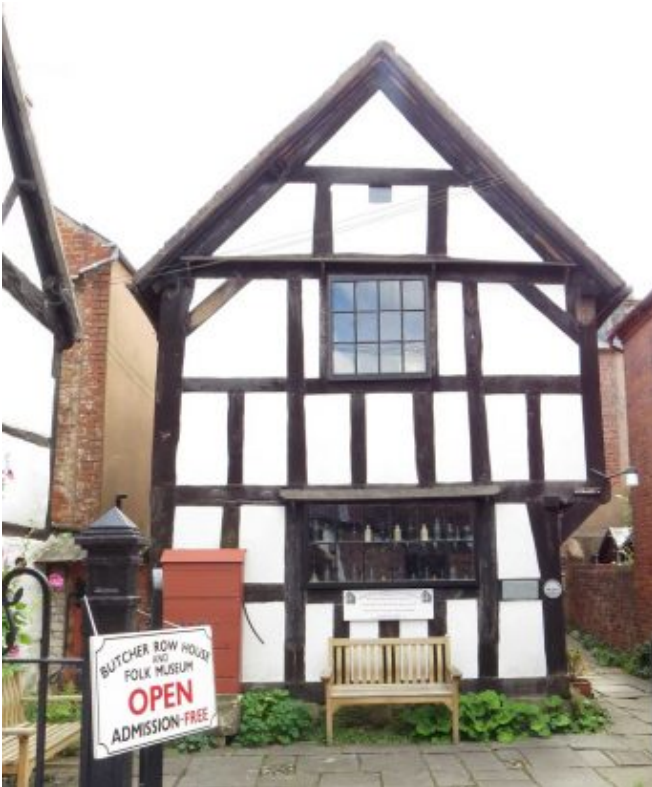
The Butchers House, Ledbury