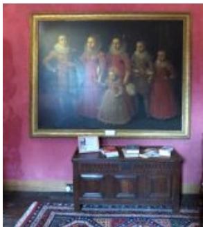
Bloody Mary's Room, Hellens Manor