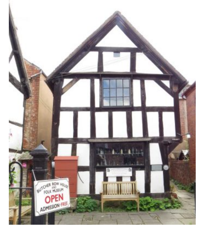
The Butchers House, Ledbury