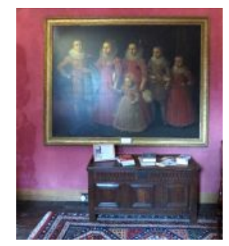
Bloody Mary's Room, Hellens Manor