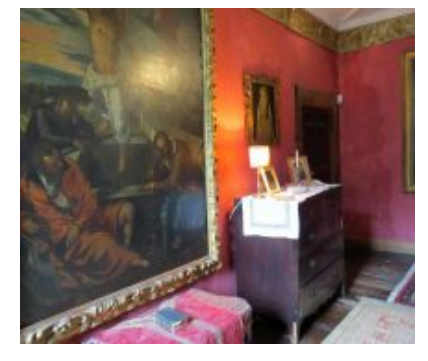
Bloody Marys room