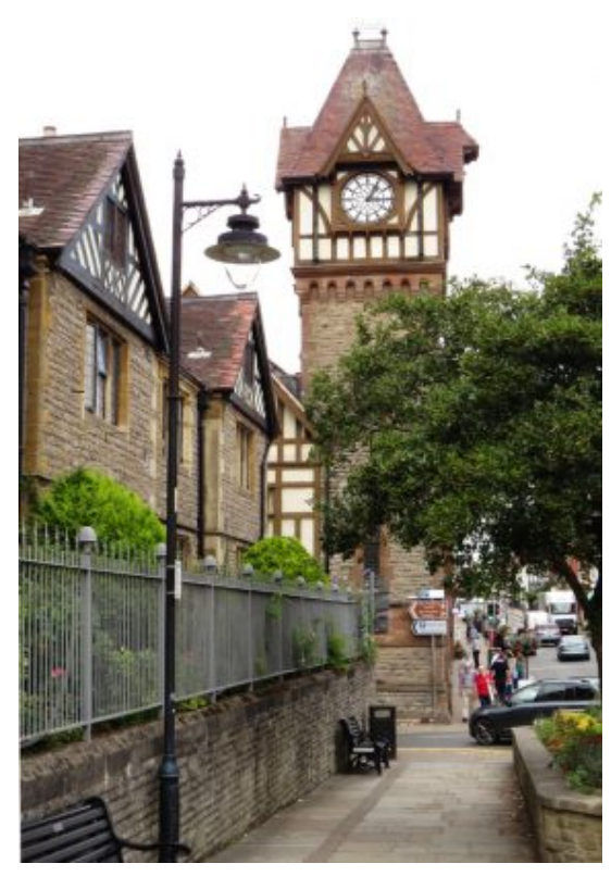
Ledbury Clock Tower