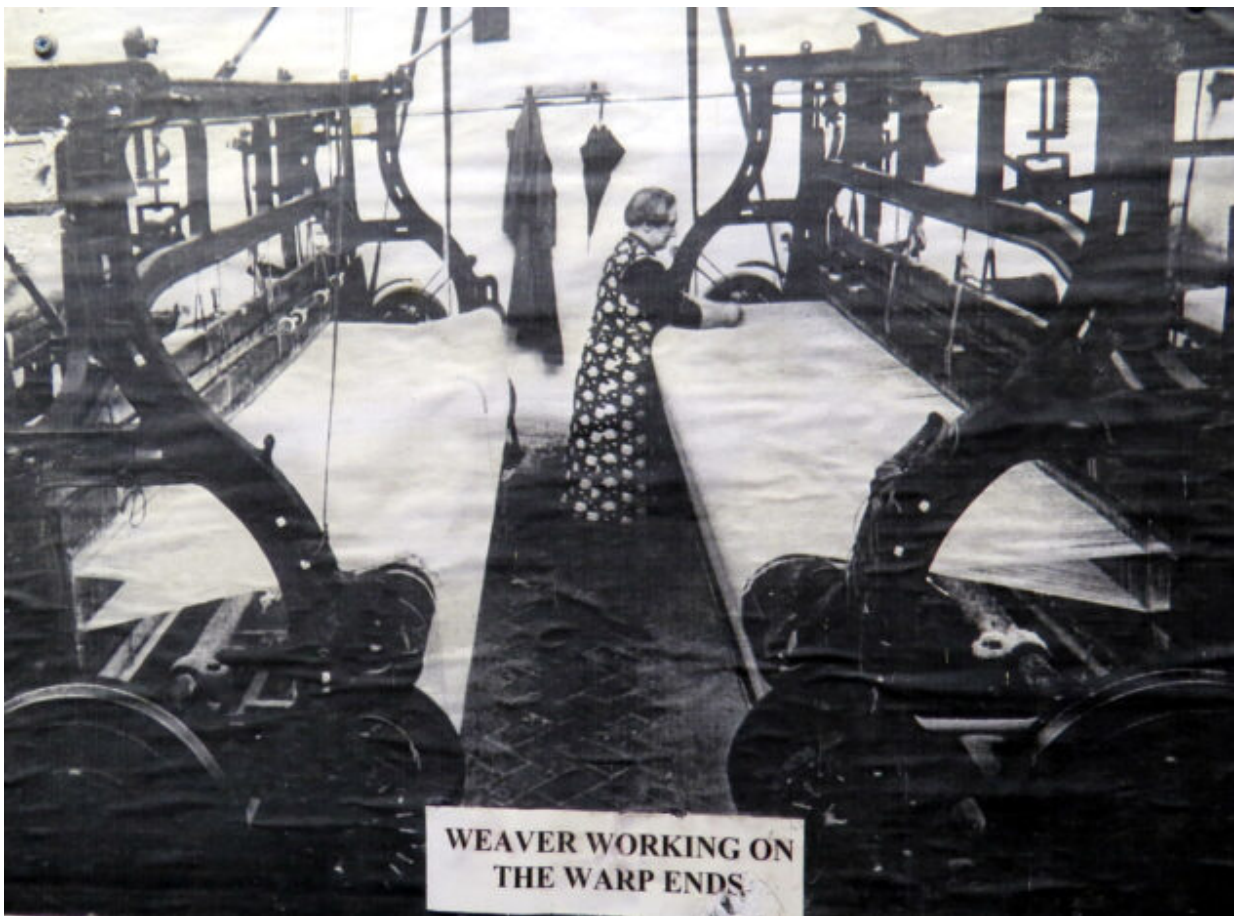
The old Machines

For those wishing to learn more about the stories of the Mill, I've just found a book and tv series about life of the children in the Cotton Mills further north in the UK. Fascinating read, and TV series which was based on a few of the stories that came out of the archives: