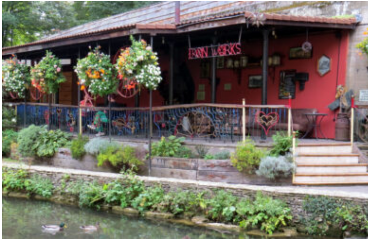
Egypt Mill Terrace