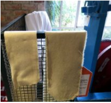
Pre and post finishing