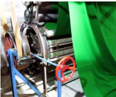
Raising the Cloth