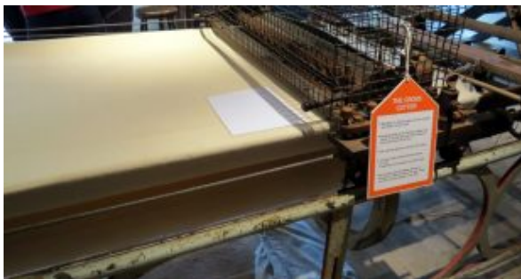
Shearing the Cloth